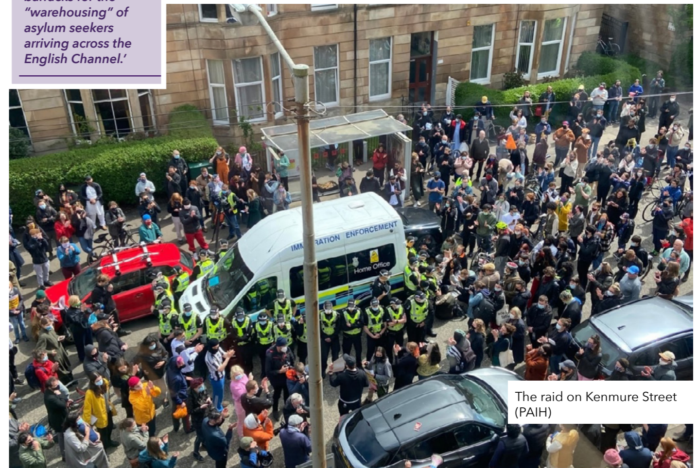
The raid on Kenmure Street (PAIH)