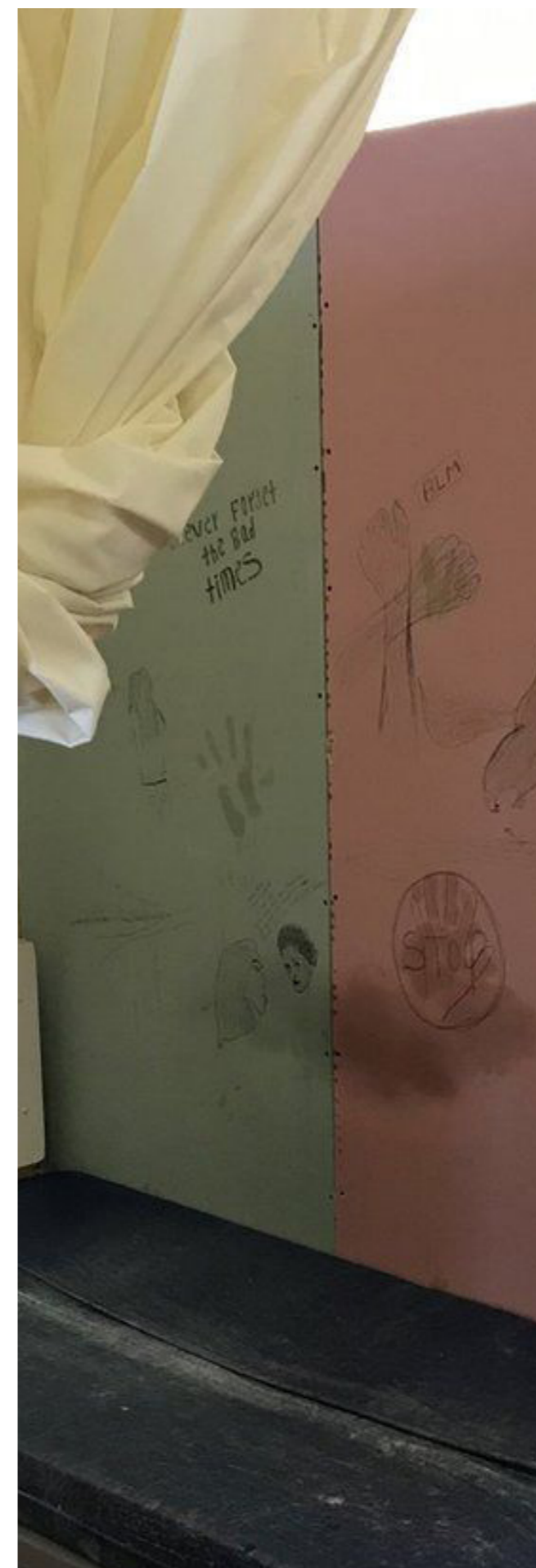
Sleeping area at Napier barracks